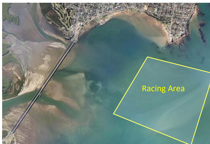
Figure 11.1 – Racing area